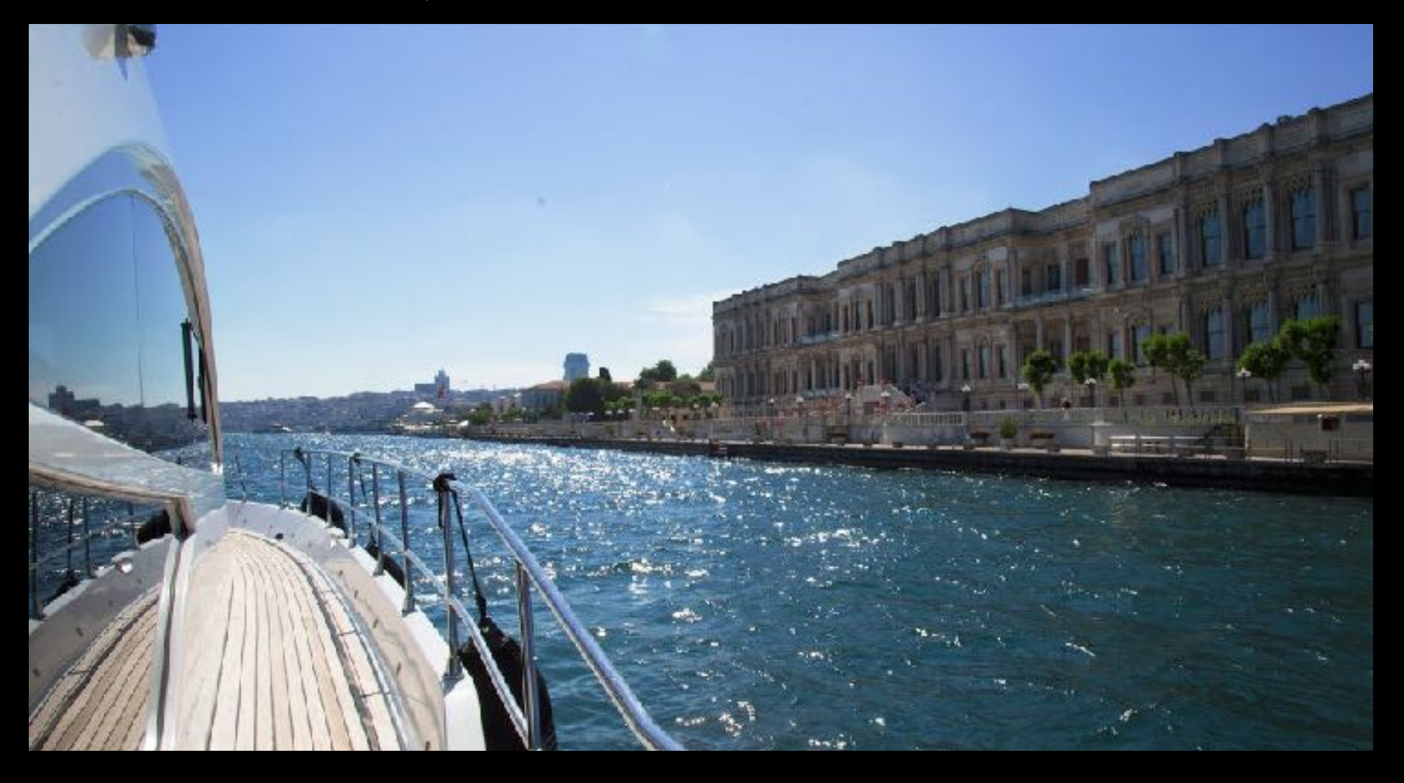
Fly to Istanbul and check-in at the hotel.

In the evening we will take a Private Boat Cruise on the Bosphorus Straight. During the sunset we will have our farewell dinner.