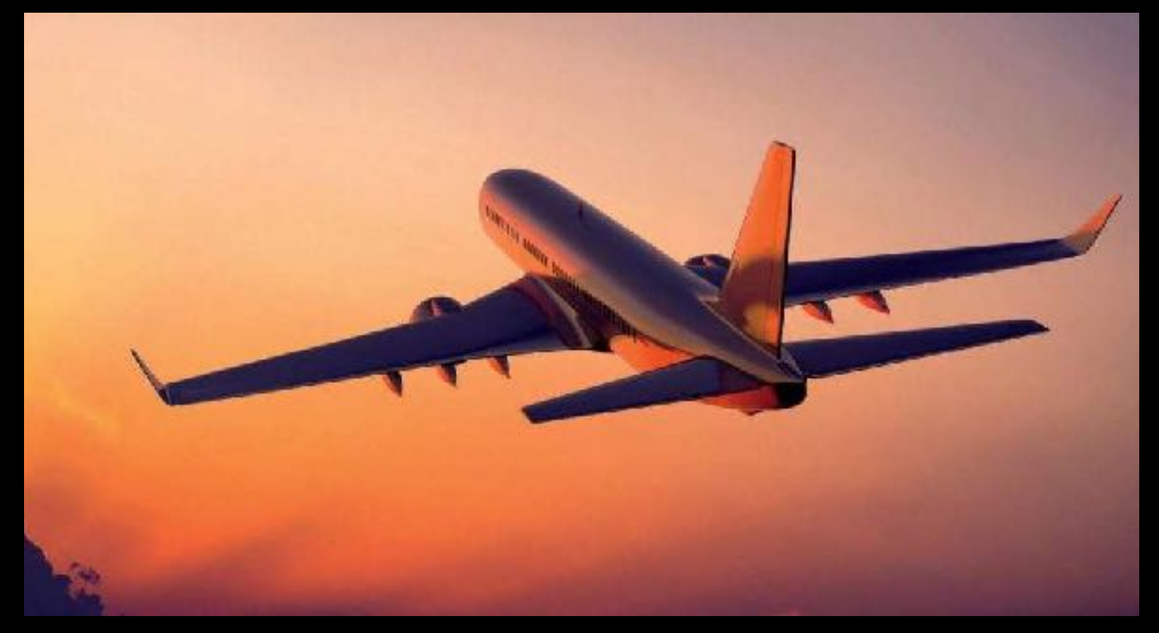
Breakfast, followed by final departure.

Our local representative will transfer you from hotel to the Airport in time for your international flight.